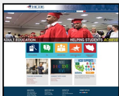
Website Launch! Site Focuses on Students We Serve pg. 3