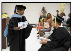
Four Seniors Recognized at 2016 AB School West Graduation pg. 4