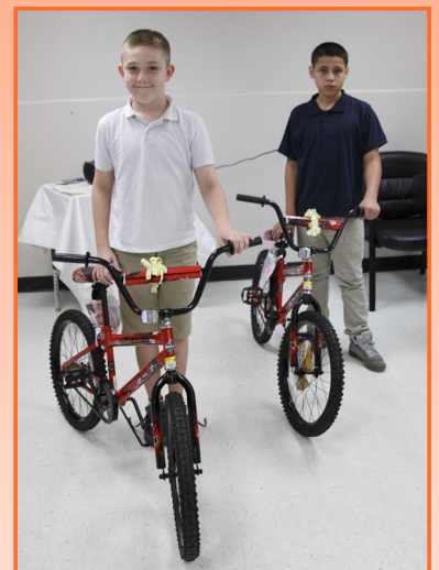
Above: AB School West perfect attendance students rewarded with new bicycles