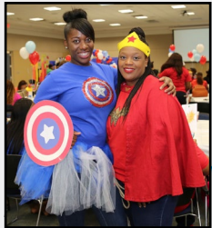
Head Start Celebrates End-of-Year at Superhero Themed Event pg. 2