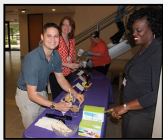
Human Resources Hosts Yogurt Bar for Health and Fitness Month pg. 2